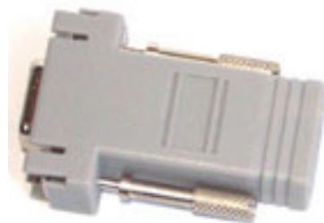
SIN-9 Serial Adapter

AMS offers the SIN-9 serial adapter. It features a DB9 terminal on one side to connect with the serial port (or a USB to serial converter) and an RJ45 terminal on the other end which is connected with the AMS motion control product. The device does not include any electronics. The controller may have an RS-232 or RS-422 interface. The design allows only one axis per COM port.